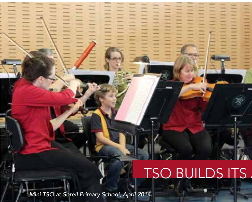
Mini TSO at Sorell Primary School, April 2014.

A NUMBER OF good news items flowed from the release of the 2014 Annual Report for Tasmanian Symphony Orchestra Holdings Limited.